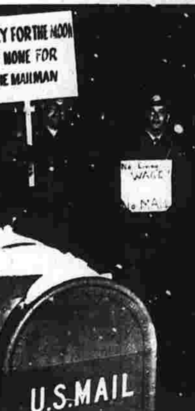
Letter carriers picket in front of main Post Office in downtown St. Paul, Minn. A light snow fell when picketing got underway.