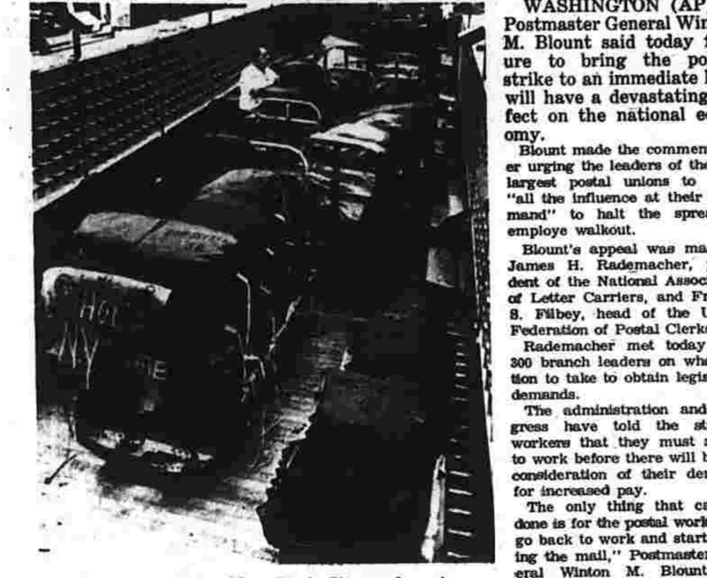
Mail bags posted for New York City and environs are stacked on hand trucks at Terminal Annex post office in Los Angeles today awaiting an end to the growing strike of mailmen.