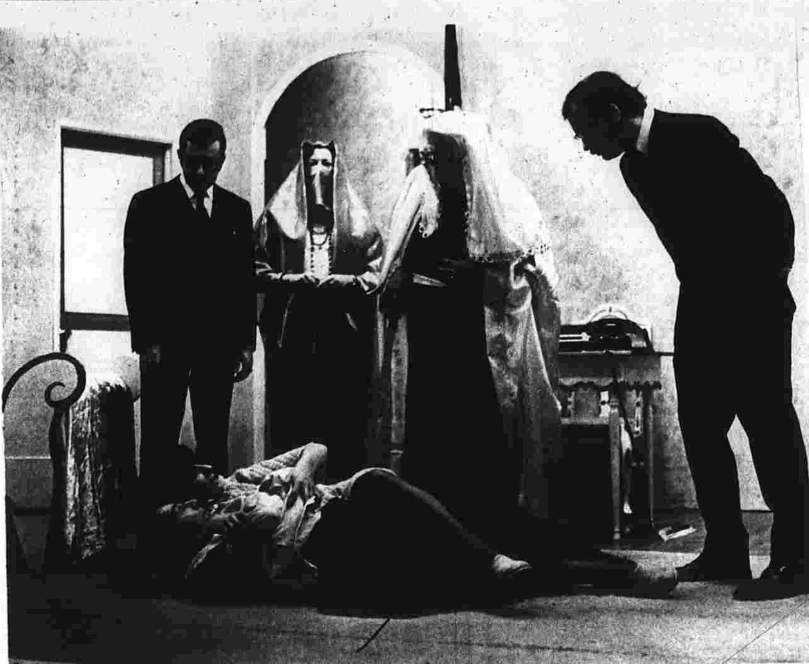
Scene from Play Scheduled for Tonight, Tomorrow

"Charge It" with your Master Charge Card